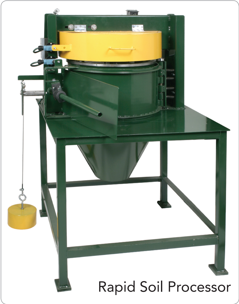
Rapid Soil Processor