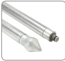
Includes a hard-cone tip and a disposable cone Adapter