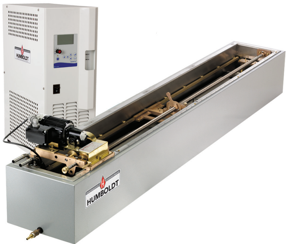
Ductility Testing Machines