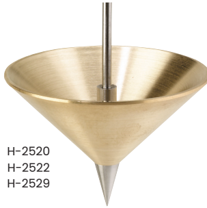
H-2520 H-2522 H-2529