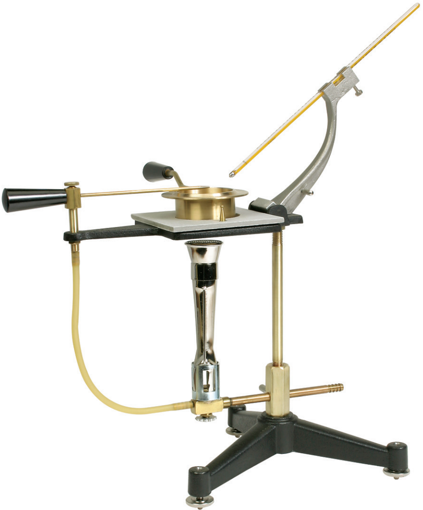
Cleveland Flash & Fire Point Tester