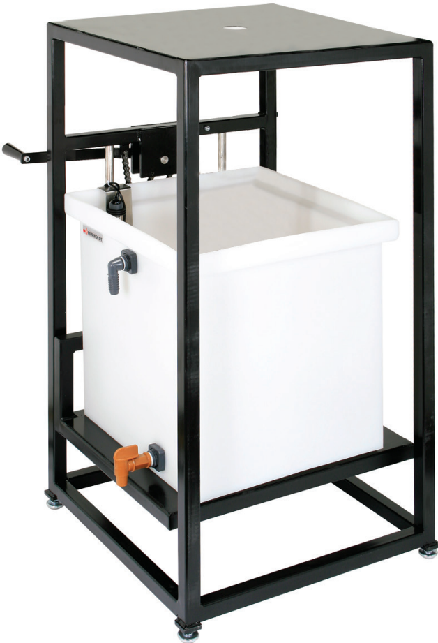
Specific Gravity Bench Set