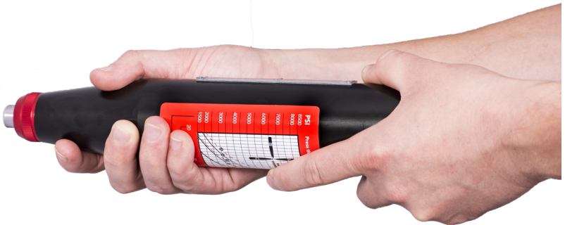
Figure 2: Always hold the Rebound Hammer with both hands perpendicular to the surface

Before the Hammer can be used for testing, the piston must be released out of the hammer into the testing position. Typically during storage and transportation, the Hammer piston will be locked inside the Rebound Hammer and will need to be released from the storage position. If the piston is not extended into the test position, place the end of the piston against a stiff surface and gently press the Rebound Hammer firmly against the surface. You will hear a click, and the piston will extend into the test position.