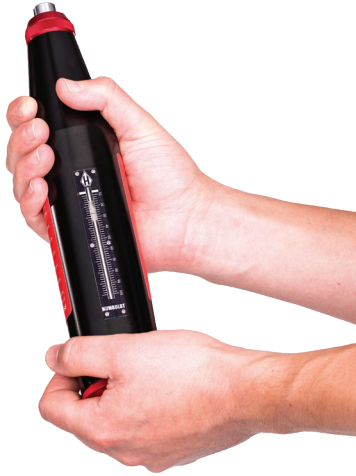
Figure 1: The Concrete Rebound Hammer

Always hold the Concrete Rebound Hammer in both hands while in use. Also, when in use, keep the hammer perpendicular to the surface you are testing with the scale pointing up, making it easier to read.