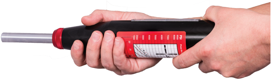
Figure 3: Push the piston in as far as it will go

To perform a test, make sure the piston is extended and gently press the Rebound Hammer against the concrete surface to be tested. When the piston is pressed all the way into the Rebound Hammer, continue to push harder until you hear a rattling sound. Keep the Rebound Hammer firmly pressed against the concrete surface and read the rebound number on the scale.