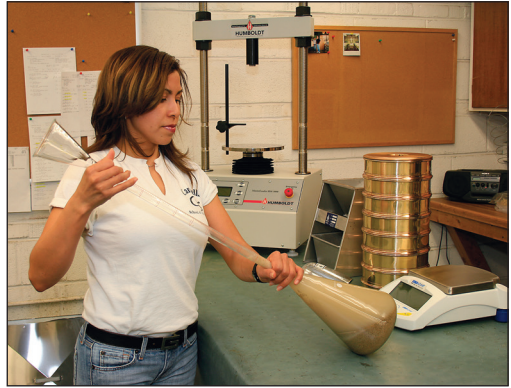
Humboldt Specific Gravity Flask (Phunque Flask)