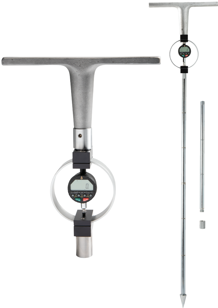
Digital Proving Ring Penetrometer