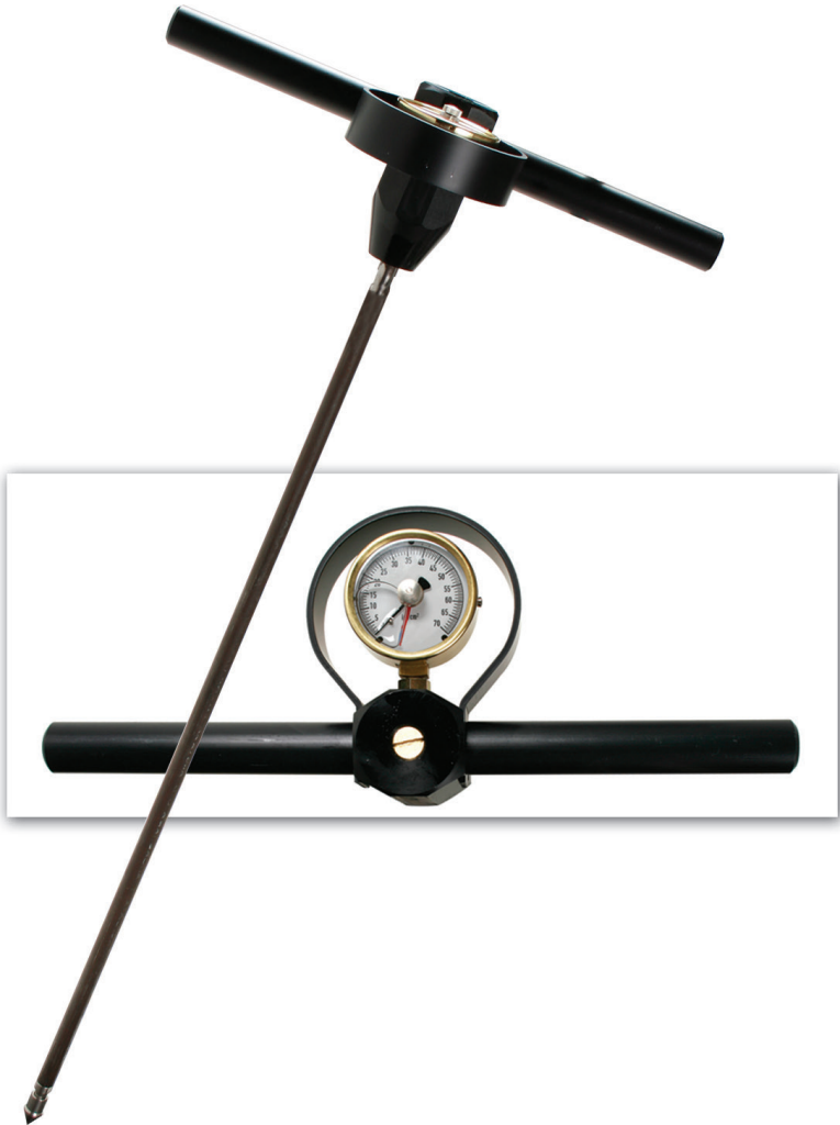
Portable, Static Cone Penetrometer