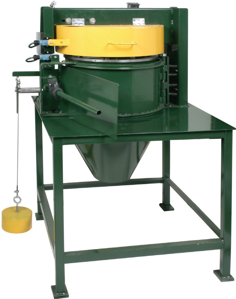
Rapid Soil Processor