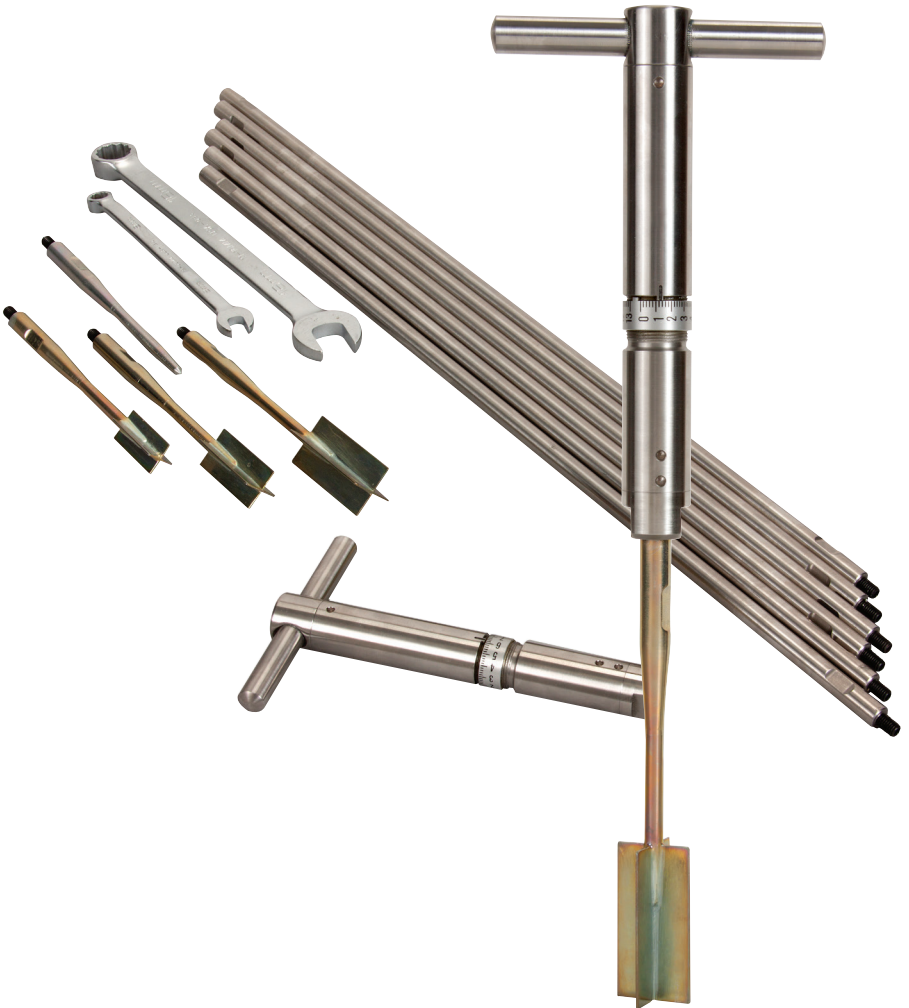
Vane Inspection Kit