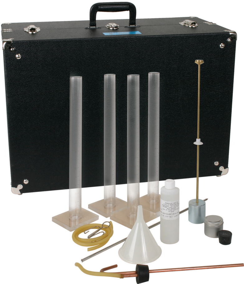
Sand Equivalent Test Set with Case